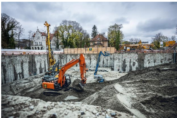
(1) On a former textile site in Munich’s Schwabing district, the Bauer Umwelt Division of BAUER Resources GmbH constructed an 8 m deep excavation pit.