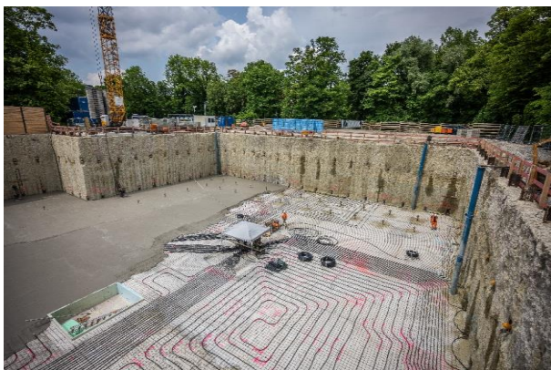
(2) Roughly 3,000 m 2 of Mixed-in-Place wall (MIP) and a 2,500 m 2 foundation slab were geothermally activated.